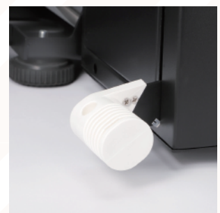
Easy Pinch Roller Lever