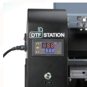
Visual printing platform