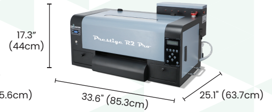
Prestige R2 Pro